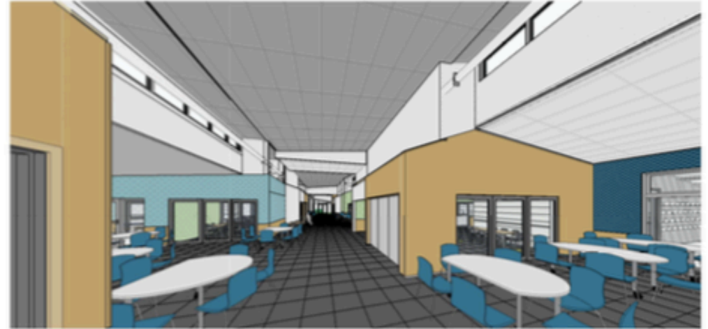
Learning St 3 SCALE @A3 -