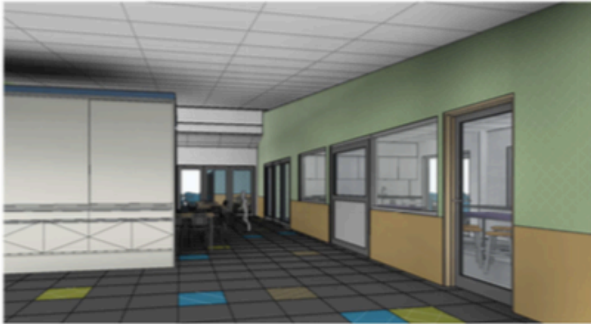
In Pod SCALE @A3 -