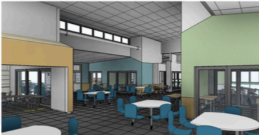
Learning St 1 SCALE @A3 -